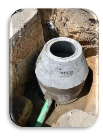
Hocking St. sewer line manhole.

https://www.cityofplacerville.org/capital-improvement-projects