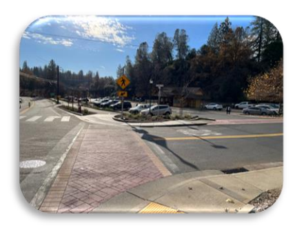
The intersection at Mosquito Rd. and Clay St.